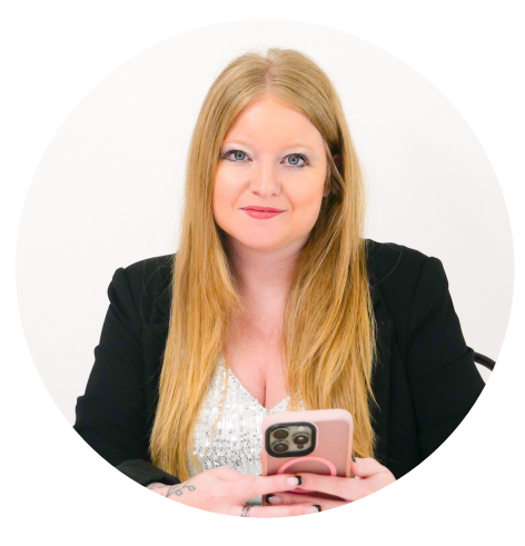
Please feel free to reach out with any questions.